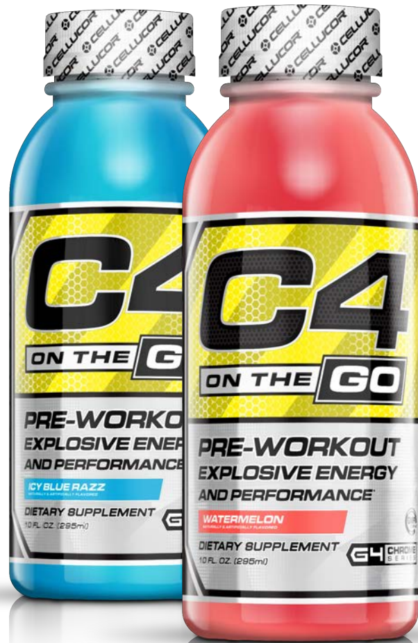
2015 Edition of C4 On The Go

In 2015, we entered the beverage space with our first nationwide launch of C4 ON THE GO (OTG) .